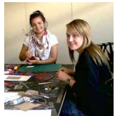
Above: Some of the Workshop attendees in Cape Town hard at work in an effort to complete the brief handed to them.